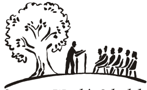
Summer Worship Schedule