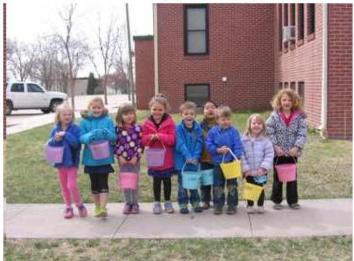
The preschoolers pose after their egg hunt on April 17.