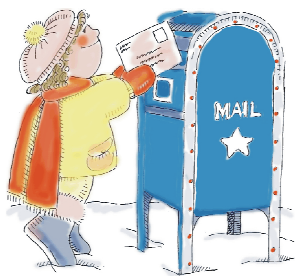
Cards for our College Students