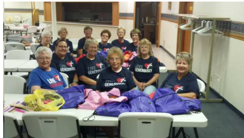
Volunteers assembling the school kit donations