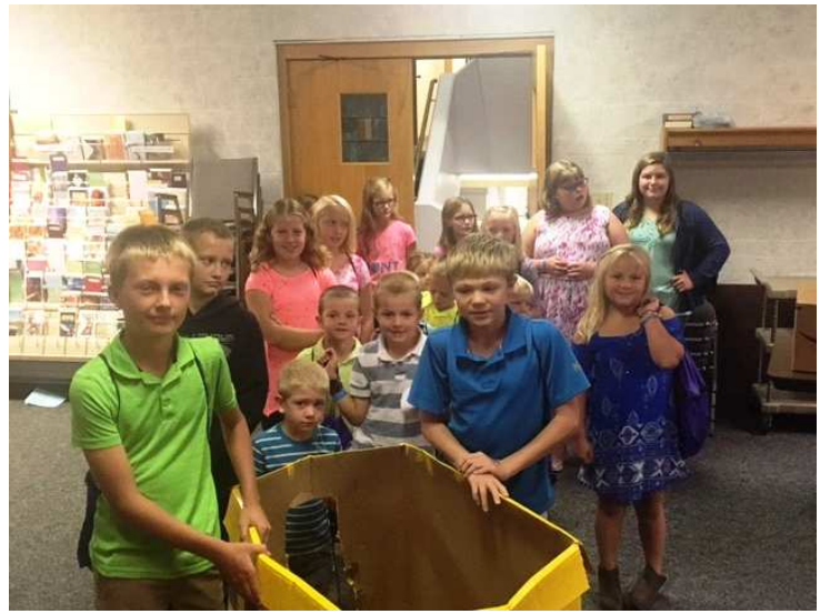
S.S. Rally Day - Children and their School Kits