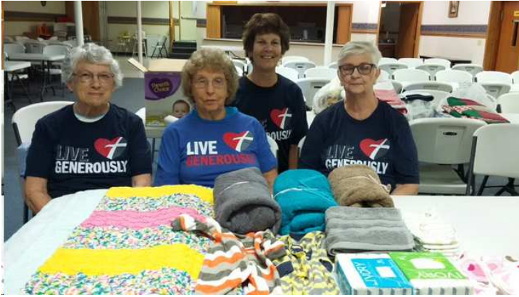
Assembling Health Kits for Lutheran Family Services